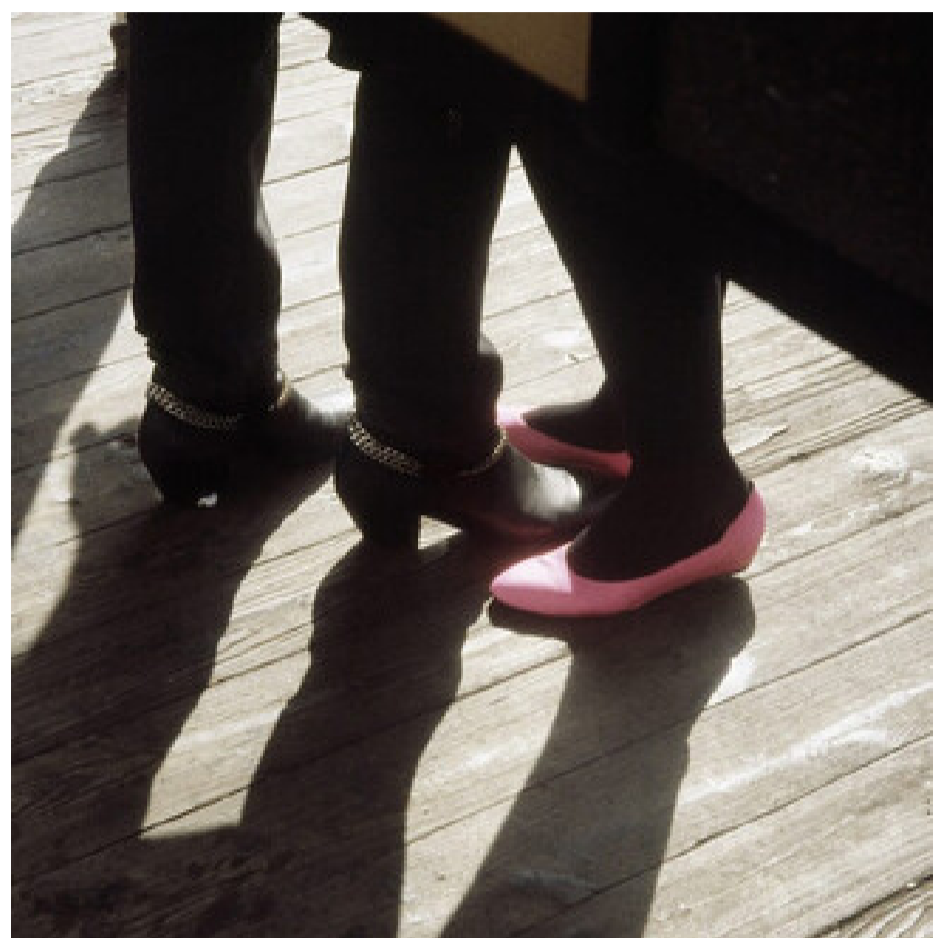
Rue Vivian Maier 28 Jan – 28 Feb 2026