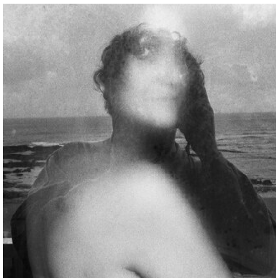
Dans les plis du temps 12 Sep – 25 Oct 2025