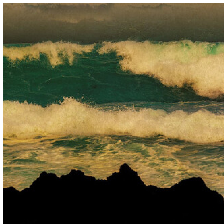
Songes chromatiques 6 Nov 2025 – 17 Jan 2026