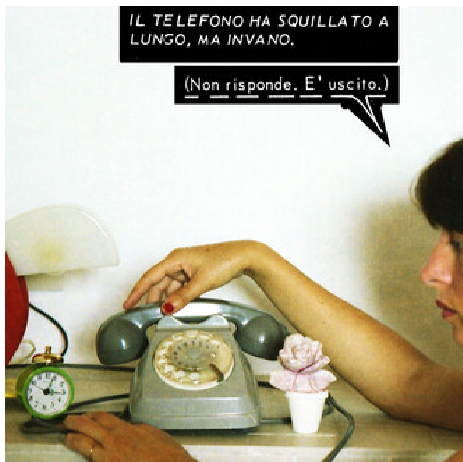
Jeux de mots 12 Mar – 13 May 2026