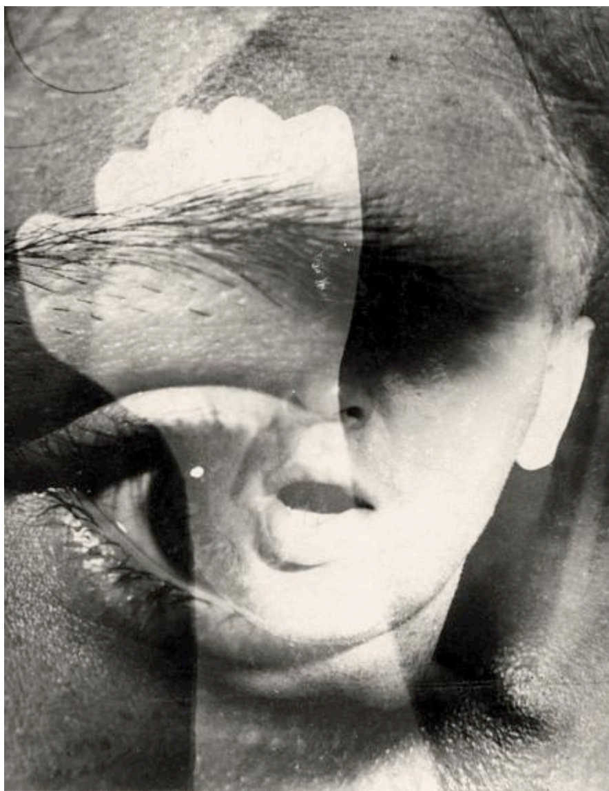
Val Telberg Untitled (Rebellion Call), c. 1940-50 © Estate Val Telberg / Courtesy Les Douches la Galerie, Paris

Val Telberg » An American Surrealist in Paris