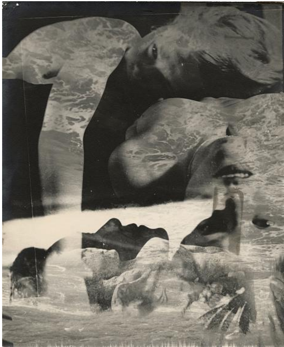
Val Telberg Profile of Anne, c. 1953 Vintage gelatin silver print, printed by the artist