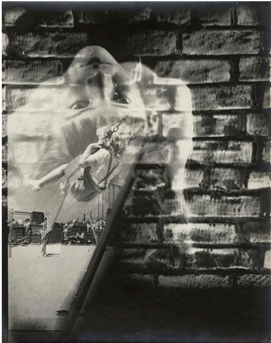
Val Telberg Yaddo Period, c. 1953-54 Vintage gelatin silver print, printed by the artist