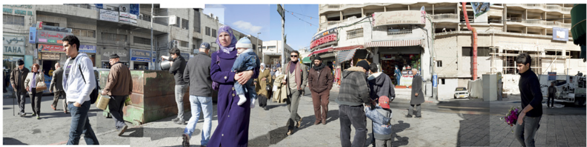
Border Lines Salah Ad-Din Street, East Jerusalem, Occupied Territories, 2009 C-Print 55 x 269 cm Edition of 9 + 2 AP