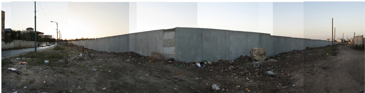
Interior Wall Separation wall between Moshav Nir Tzvi and the arab quarter of Pardes Snir, Lod, Israel, 2010 C-Print 80 x 289,6 cm Edition of 9 + 2 AP