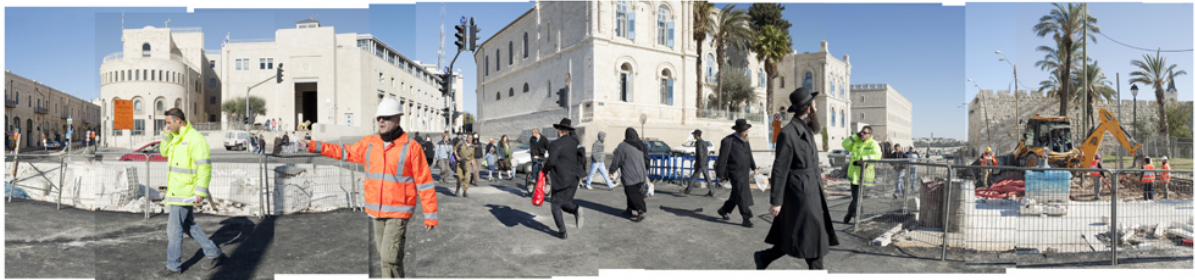
The Green Line, Limite between East and West Jerusalem, Israel – occupied territories, 2009 C-Print 55 x 197 cm Edition of 9 + 2 AP